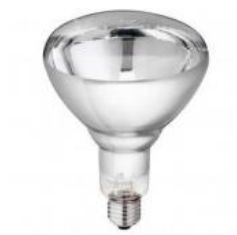
White infrared lamp