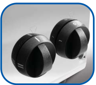
Slot selector and timer switches