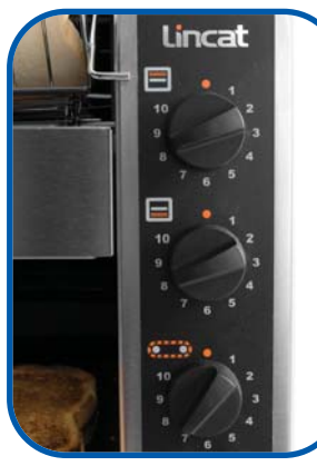
Individual controls for top and bottom elements

Optional lockable cover for control panel