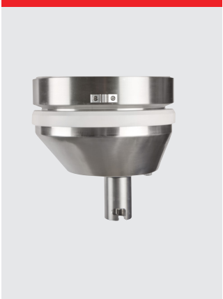
Waterproof planetary head, stainless steel, IP54