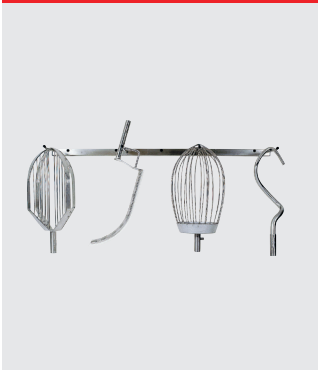
Tool rack, 127 cm