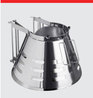
Removable safety guard in stainless steel. CE-certified