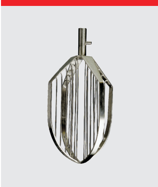
Wing whip with double pin, stainless steel