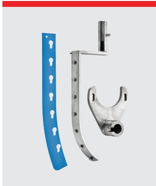
Automatic scraper, stainless steel.