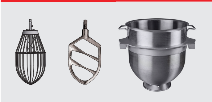
Whip with double pin, hook with double pin, beater with double pin and bowl 140 liter in stainless steel.