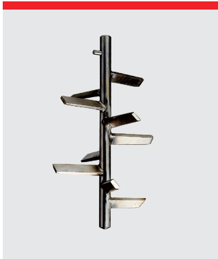
Powder mixer with double pin, stainless steel