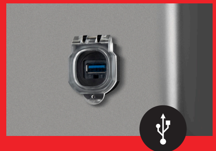
USB - IP65 Protection

Programmed receipes can be upload via USB. Excel or Google Sheets can be used as a programmable editor.