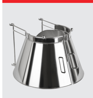
Removable splash guard in stainless steel. CE-certified