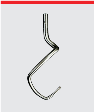
Hook with double pin, stainless steel