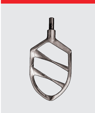
Beater with double pin, aluminium