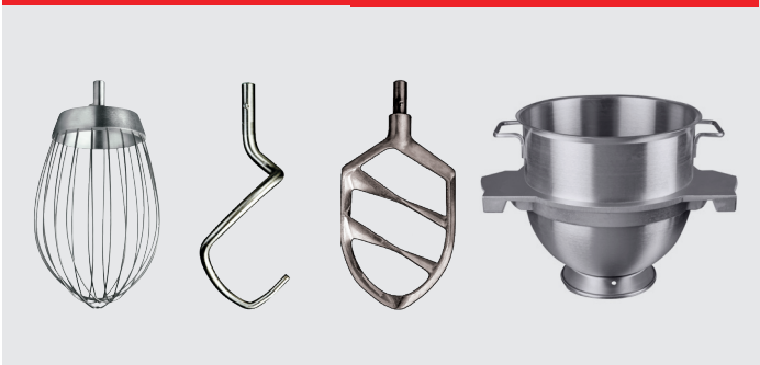
Whip, hook, beater and bowl 140/80 liter in stainless steel.