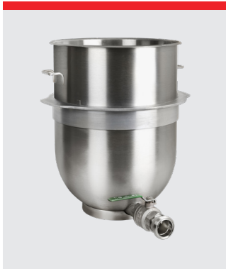
Bowl with bottom draining pipe, stainless steel