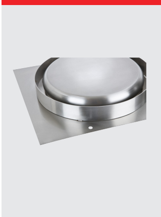
Air ventilation - Double layer protected, stainless steel, IP54