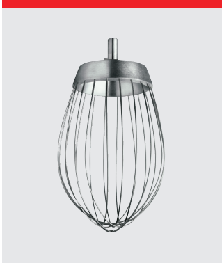
Whip with double pin, with thinner wires, stainless steel