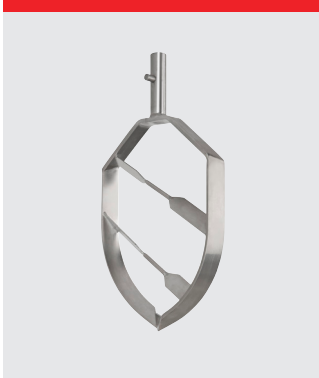
Beater with double pin, stainless steel