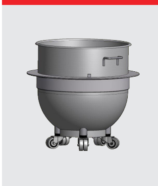
Wheels for bowl