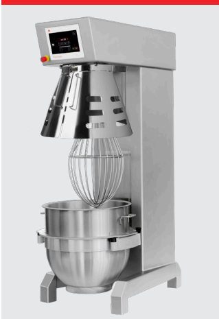
Marine version, stainless steel