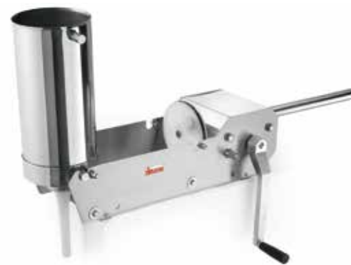
Tilt-cylinder with no-spillage lock pin