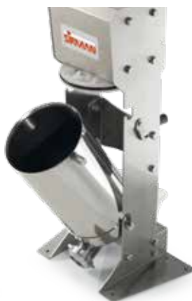
Product loading without removing cylinder