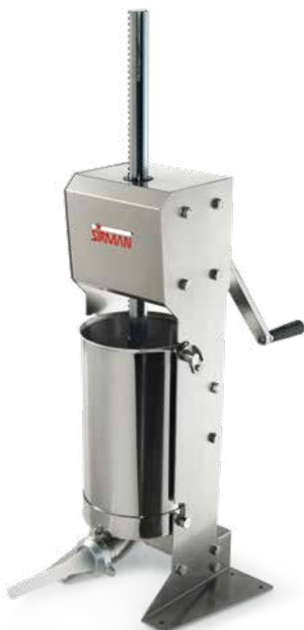
IS 12 VX