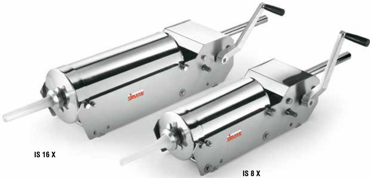
IS 16 X